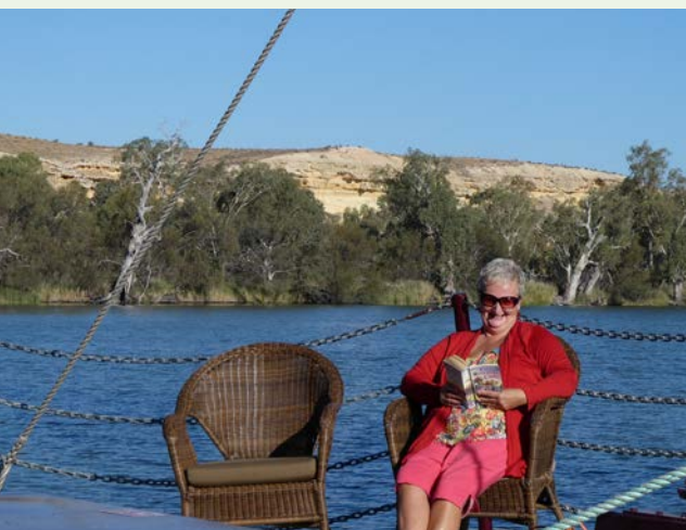
ENJOY RELAXATION CRUISING THE RIVER