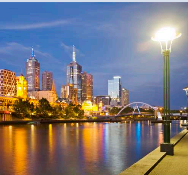
MELBOURNE CITY SKYLINE