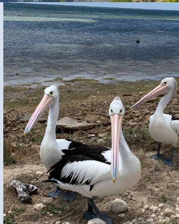
COASTAL BIRD LIFE