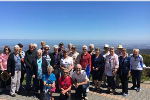
A WONDERFUL GROUP EXPERIENCE