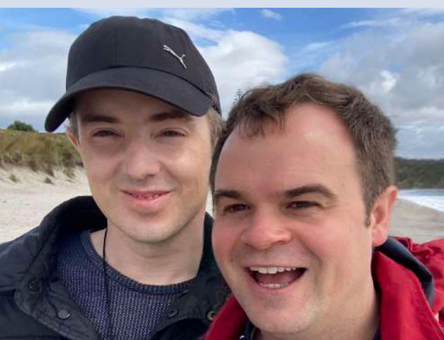
YOUR FUN AND VIBRANT HOSTS