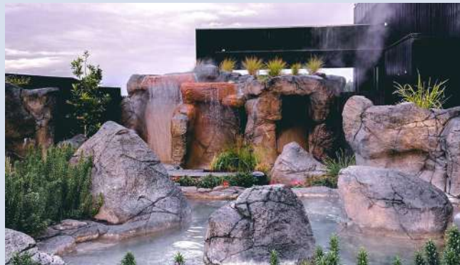
DEEP BLUE HOTEL & HOT SPRINGS