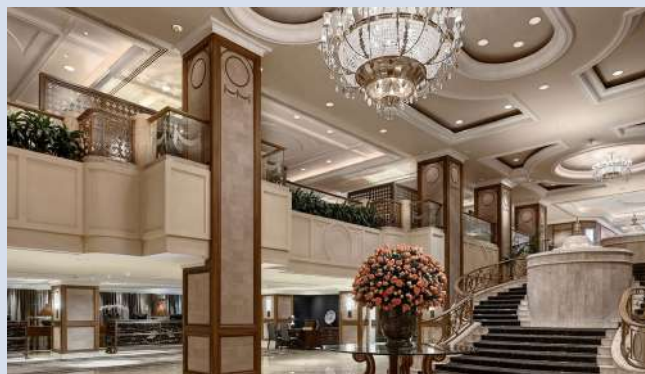
LANGHAM HOTEL MELBOURNE