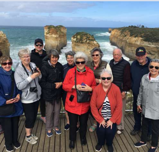
STUNNING CLIFFSIDE SCENERY