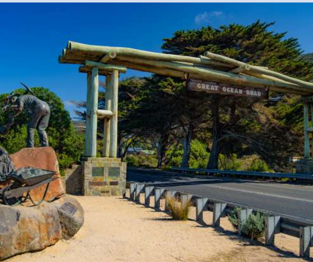
THE GREAT OCEAN ROAD