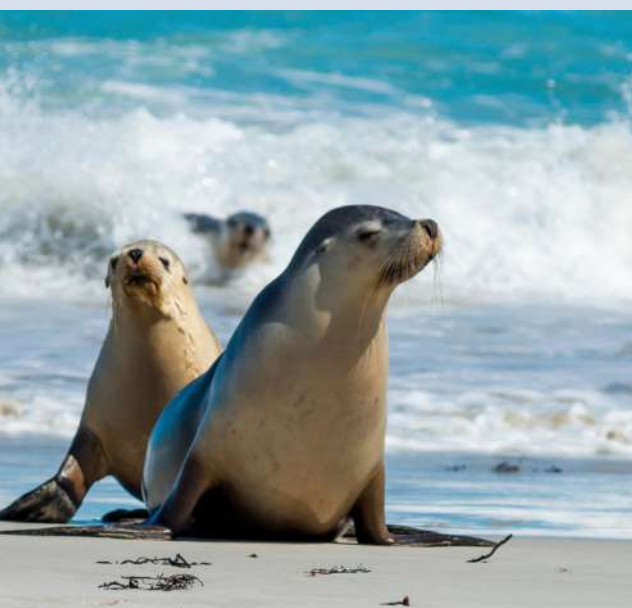
SEAL BAY SEALS