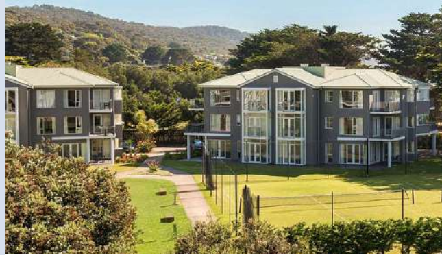
MANTRA LORNE HOTEL