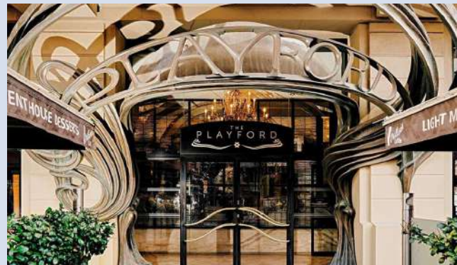
THE PLAYFORD MALLERY BY SOFITEL