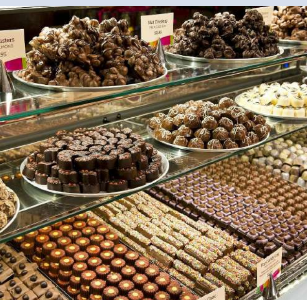
YARRA CHOCOLATE FACTORY