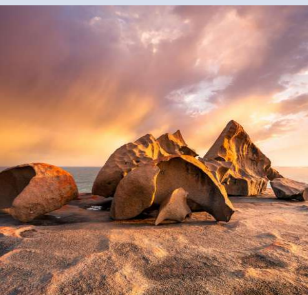
KANGAROO ISLAND LANDSCAPE