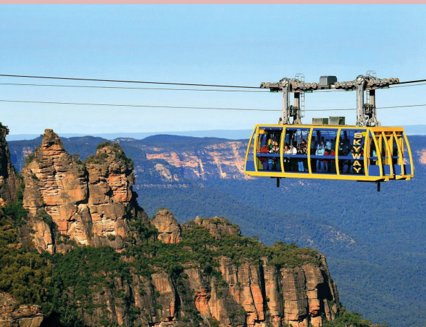
THE BLUE MOUNTAINS