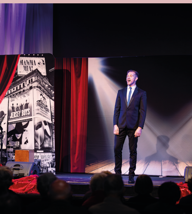
EXPERIENCE OUR WELCOME GALA EVENT