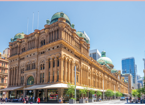
HIGH TEA IN QUEEN VICTORIA BUILDING