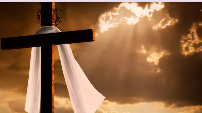
JESUS CHRIST SUPERSTAR