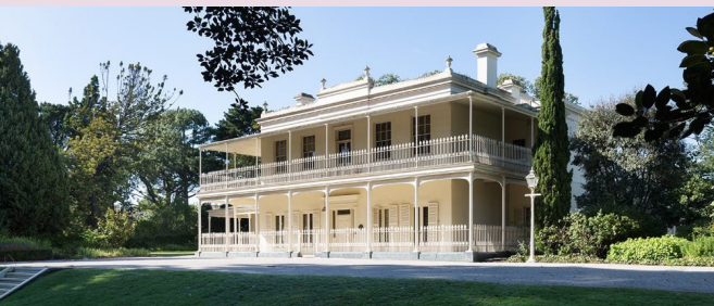
THE BEAUTIFUL COMO HOUSE