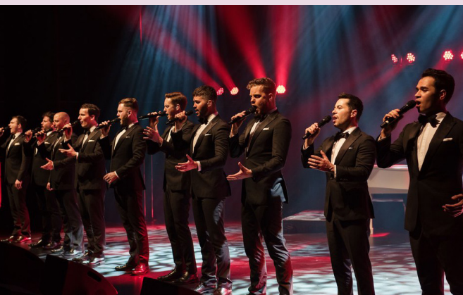
THE TEN TENORS