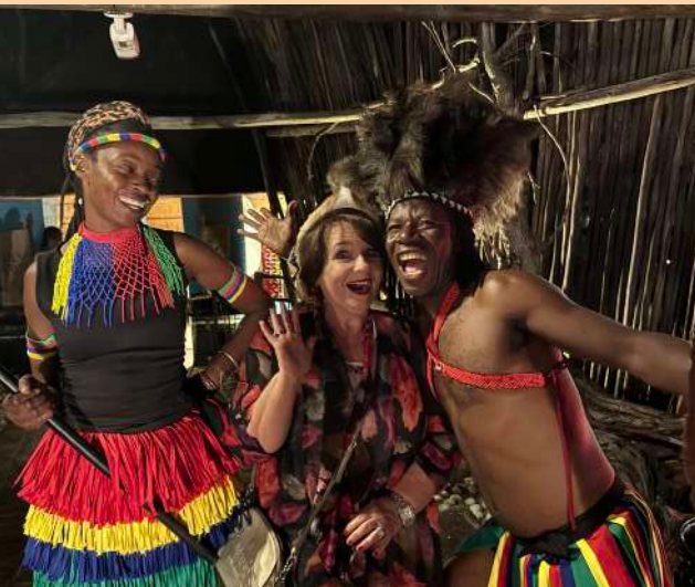
BOMA DRUM SHOW