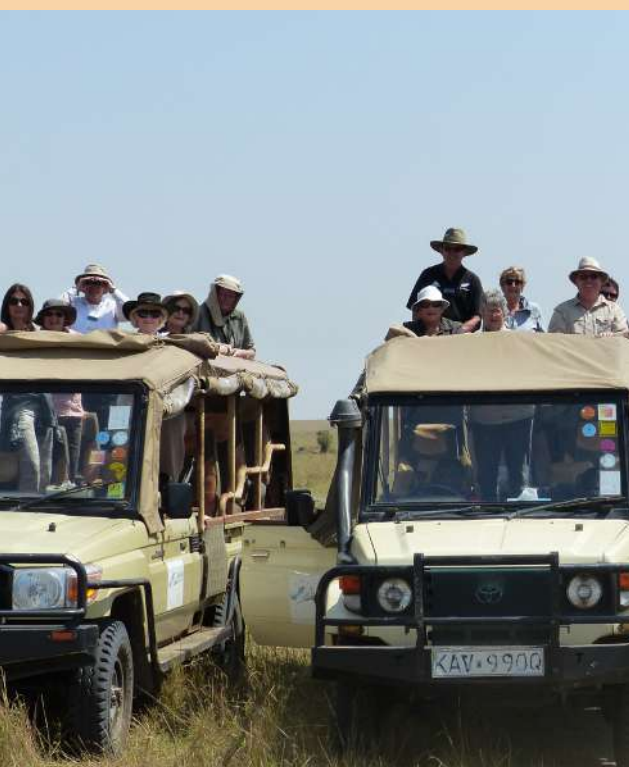
EXCITING GAME PARK DRIVES