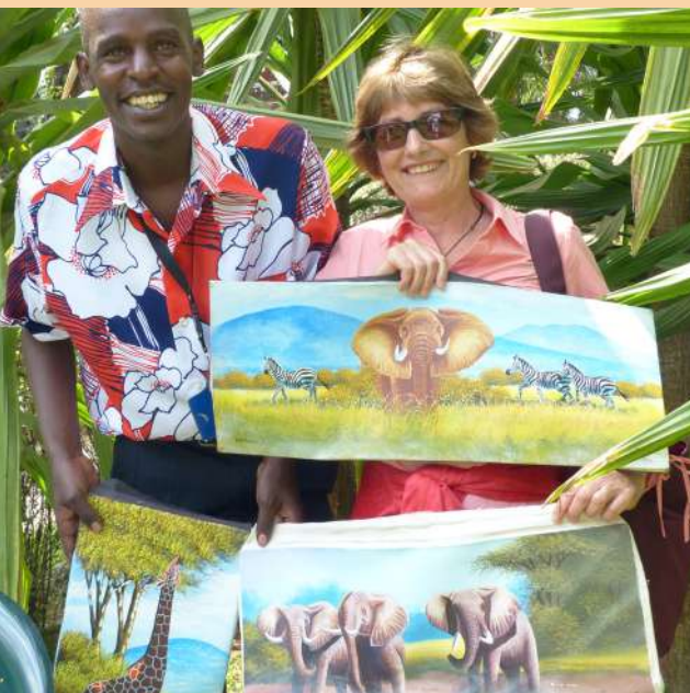
PICK UP SOME KEEPSAKES