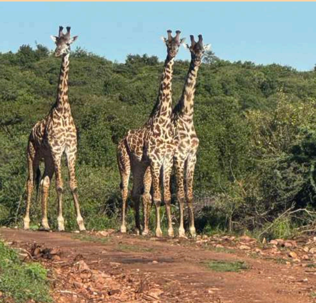
CHOBE NATIONAL PARK