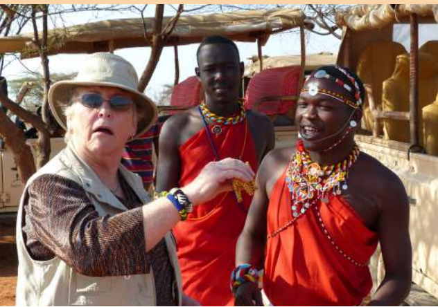
MEETING THE LOCAL PEOPLE