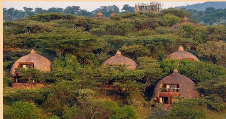
SERENGETI SERENA SAFARI LODGE