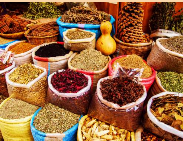
VIBRANT SPICE MARKETS