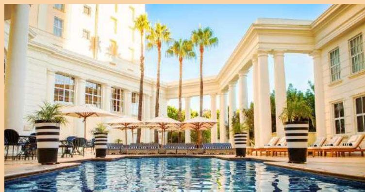
SOUTHERN SUN THE CULLINAN