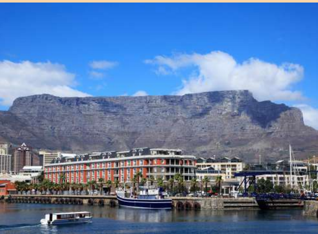
TABLE MOUNTAIN, CAPE TOWN