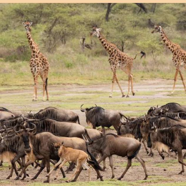
GAME PARK DRIVE