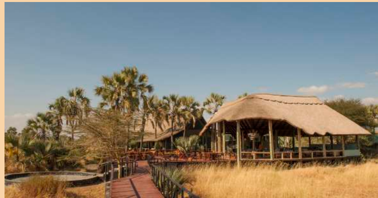
MARAMBOI TENTED CAMP