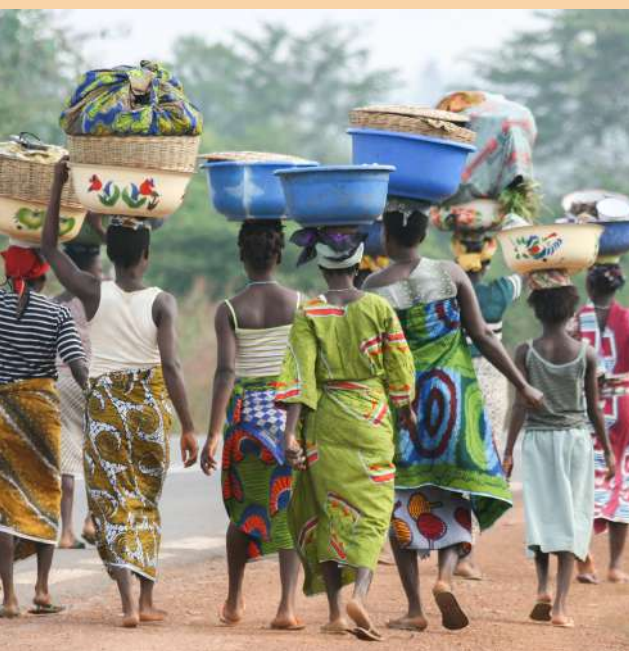
CULTURE AND COLOUR