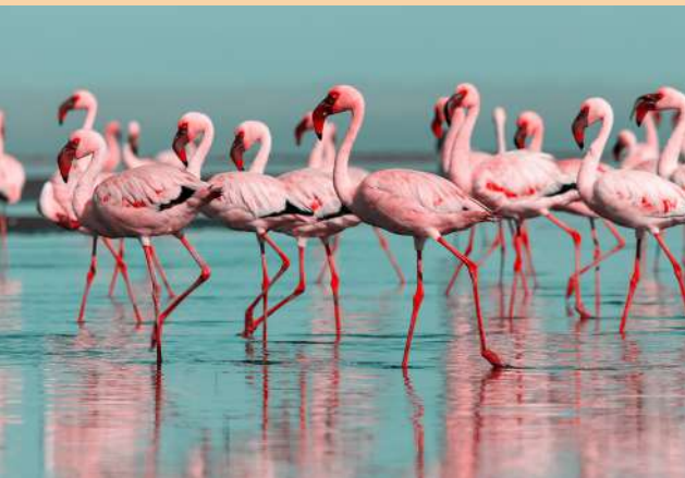
AN ABUNDANCE OF FLAMINGOS