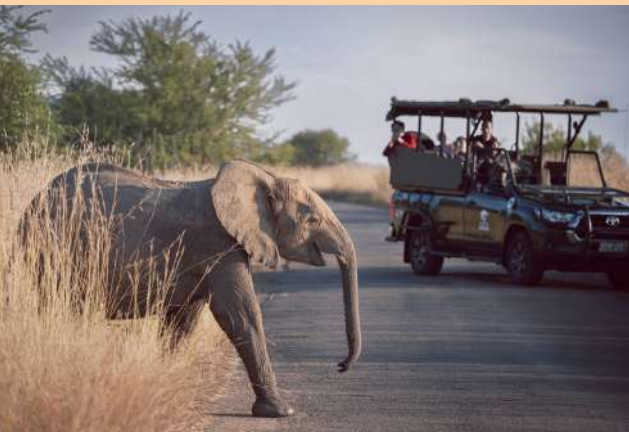
EXPLORE THE SERENGETI