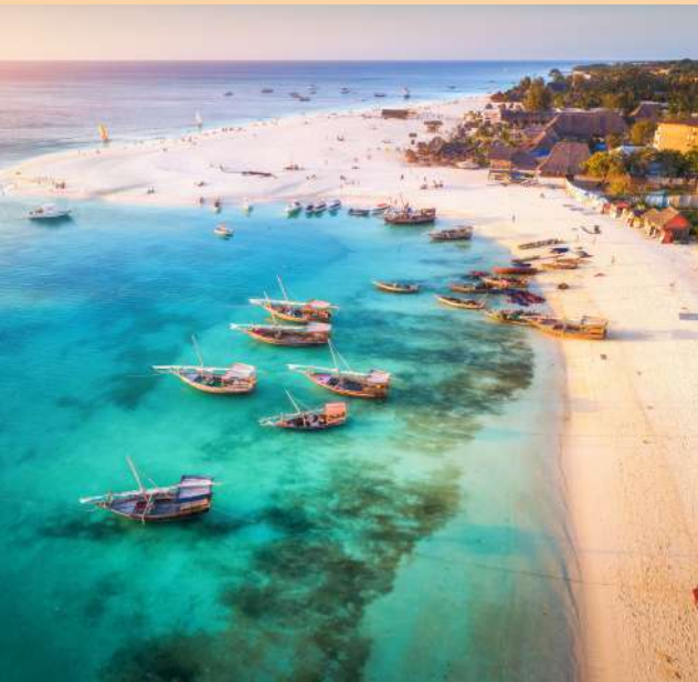
THE COAST OF ZANZIBAR