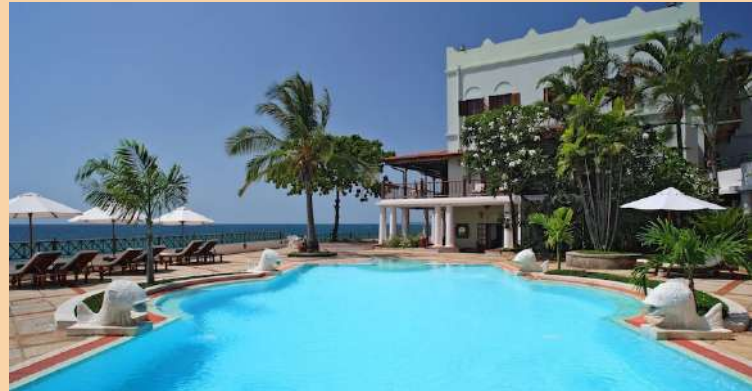
ZANZIBAR SERENA HOTEL