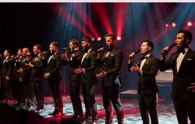
THE TEN TENORS