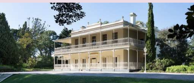
THE BEAUTIFUL COMO HOUSE