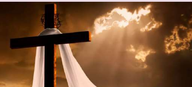
JESUS CHRIST SUPERSTAR