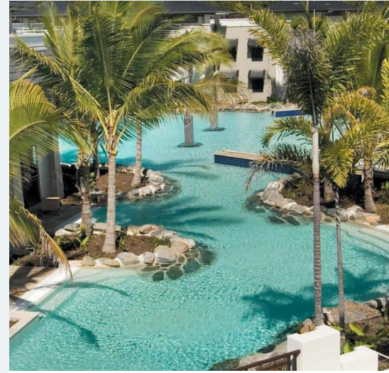
PULLMAN PORT DOUGLAS SEA TEMPLE RESORT & SPA