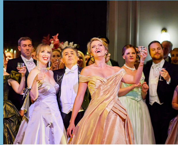
LA TRAVIATA AT THE SYDNEY OPERA HOUSE