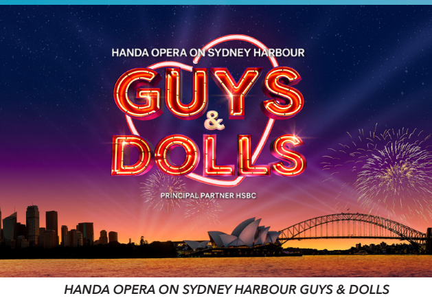
HANDA OPERA ON SYDNEY HARBOUR GUYS & DOLLS