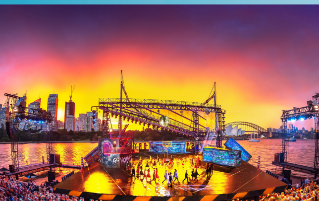
HANDA OPERA ON SYDNEY HARBOUR

$7866 PER PERSON TWIN SHARE SINGLE ROOM SUPPLEMENT ADD $2582