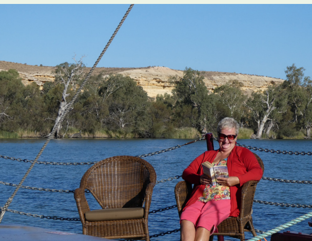
ENJOY RELAXATION CRUISING THE RIVER